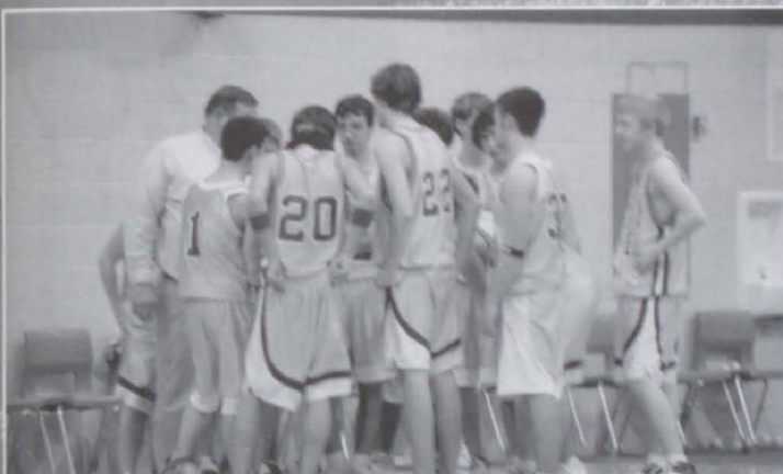
BRING IT IN... The team gathers around for a quick huddle to decide what offense to use next against their opponents.